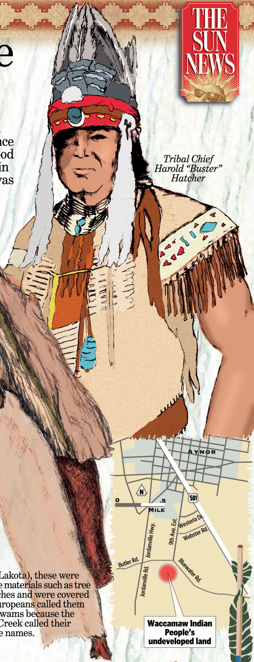
Tribal Chief Harold "Buster" Hatcher

Woodland groups such as the Waccamaw were a gathering and foraging people moving from place to place to harvest or hunt the best available food resources. They occupied seasonal campsites in areas along the coastal plain. Their language was Lakota or Siouan.